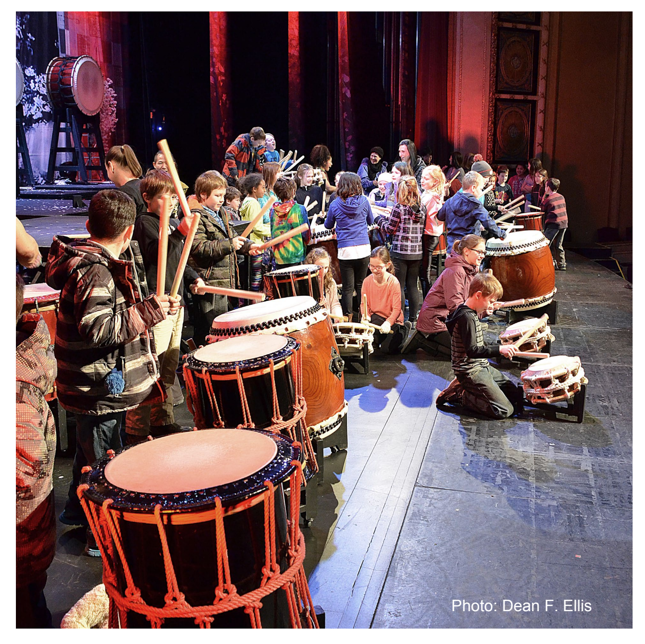
ENGAGE, INSPIRE, LEARN, COMMUNICATE, SUSTAIN